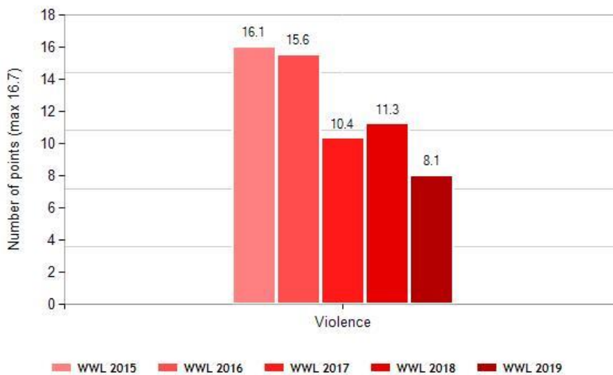
WWL 2015 - WWL 2019 Persecution Profile for Iraq (Violence)